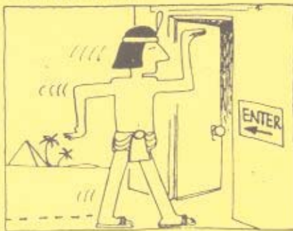
BOUND & GAGGED